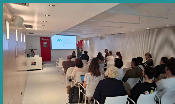
09.06.2025, Sala auditorio de Beaz, Bilbao, Spain