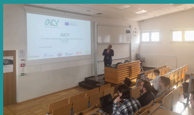
10.06.2025, Rzeszów University of Technology, Rzeszów, Poland

Photos from the pilot conferences across Europe